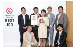
Recipients of the Good Design Best 100 prize

Keys to Communicating ⇒ http://www.dentsu.com/csr/contribution/programfornpo.html