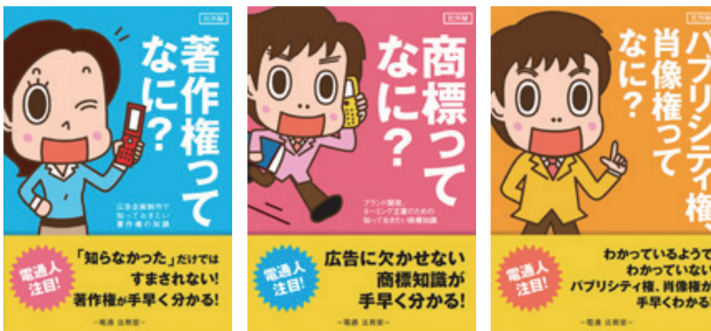
Handbooks for Laws and Regulations

As part of such efforts, for intellectual property rights in the realm of creative expression for advertising works, such as trademarks, design rights, copyrights, and publicity rights, Dentsu works to (1) improve the knowledge and awareness of employees through continuous educational and training programs, (2) disseminate information through easy-to-understand legal handbooks and manuals and the Company intranet, and (3) establish a designated department for consulting on legal and creative affairs. Going forward, Dentsu will continue to protect intellectual property rights and develop an environment for legal compliance in order to be a cornerstone for legal norms.