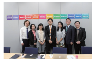
Chinese educators and Dentsu lecturers

Since 1996, Dentsu has continuously undertaken activities to support advertising education and human resources development in China. In 2016, we commemorated the 20th year of these activities. Responding to the needs of advertising-related education in China, Dentsu holds a variety of programs, such as selecting young educators from Chinese universities to train at the Dentsu Head Office, holding Dentsu Student Advertising Seminars for those studying advertising, setting up the Dentsu Innovation Lab, and conducting publishing-related activities. In August 2006, Dentsu was presented with the Education Support Special Contribution Award and, for three consecutive years—in 2014, 2015 and 2016—we received the Most Valuable Partner Award from the Chinese Ministry of Education.