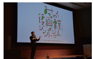
The fifth Michinoku Recovery Project Symposium