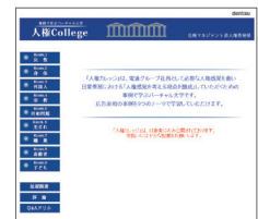
Site screen of the Human Rights College

In fiscal 2016, there were 68 consultations at the Harassment Counseling Section (FY2015 [April to December]: 49 consultations; FY2014: 53 consultations; FY2013: 50 consultations). These were individually handled so that improvements might be made to the working environment.