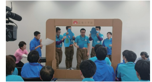
The merits of Dentsu Solari are illustrated by a classroom performance of skits.

Advertising Elementary School ⇒ http://www.dentsu.com/csr/contribution/advertisingelementaryschool.html