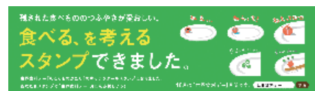
Nokorimonogatari—Taberu o Kangaeru creator stamps

A special World Food Day month website features an archive of news related to food called Taberu, o Kangaeru Tsushin .