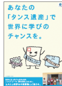
From the left Unused stamp "Harisonjiro" Unusable prepaid postcards "Kakisonjiro" Unused prepaid cards "Tsukaisojiro"

Kakisonji-Hagaki Project ⇒ http://www.unesco.or.jp/terakoya/kakisonji2017/