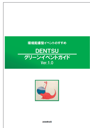
Green Event Guide