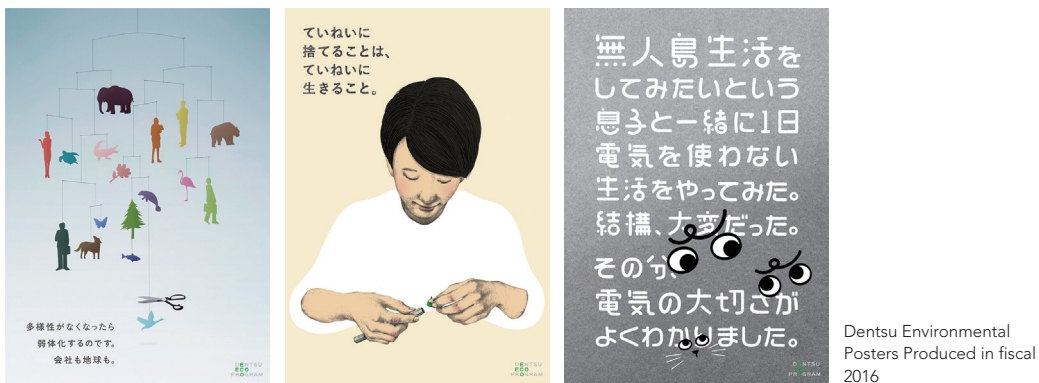
Dentsu Environmental Posters Produced in fiscal 2016

To fully utilize its communication resources, in 2005, Dentsu began inviting Dentsu and Dentsu Group employees and their families in Japan to submit environmental slogans. In 2015, there were a total of 8,133 entries in both the employee and family categories. The winning entries are used in posters designed by Dentsu art directors, thereby helping to raise environmental awareness among employees.