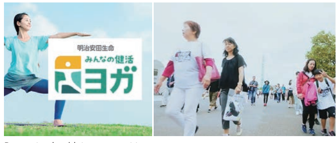
Promoting health in communities