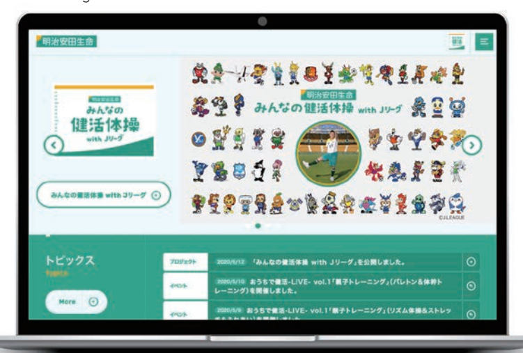
Website introducing easy exercises for everyone