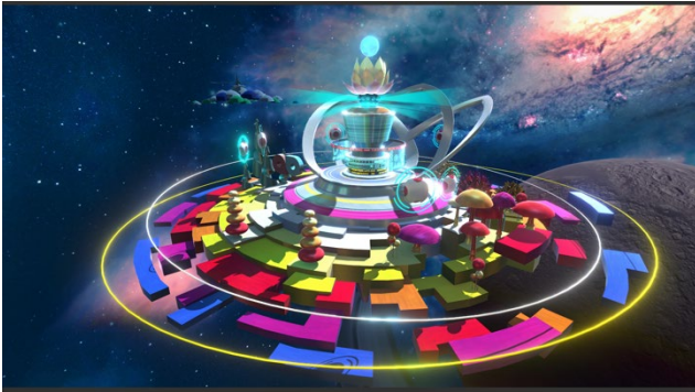
Virtual World ambr